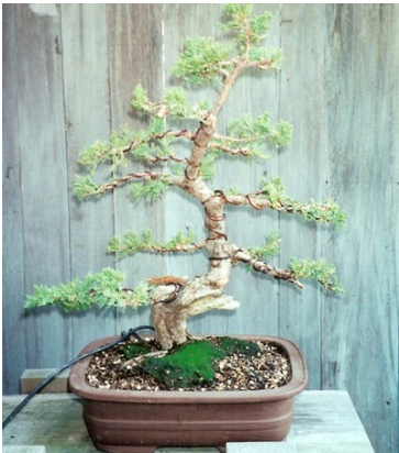
A gangly pre-teen, The tree is almost twice as tall as the pot is wide and very skinny.