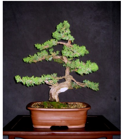
About the right height but still too skinny

As my planning for the 2011 show season be-