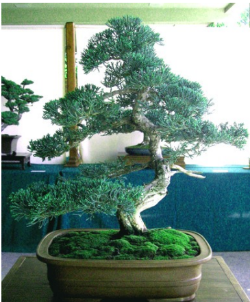
At a recent show the tree is starting to look like a "finished tree"

One interesting thing is that in addition to bending the top over to shrink the height of the tree, I also cut the top off, twice. In both cases I kept the cuttings and now have two shohin trees that are developing nicely. Someday, I may show all three trees together.