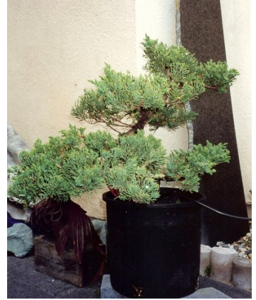
5 gallon prostrata as it was purchased at the CBS sale.