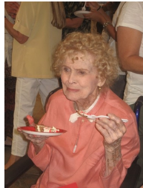
Gloria enjoying her 100 candle cake

Gloria Stewart was an accomplished artist in many fields. As an actress, she appeared in "The Invisible Man" and also in the Oscar winning "Titanic". Gloria was also a painter, a very talented bonsai artist and a long time member of the California Bonsai Society, Aiseki Kai and Bai-koen. Those clubs recently held a reception to recognize her 100th birthday. A who's who of bonsai was in attendance. Gloria passed away shortly after this gathering but will be warmly remembered by her many friends.