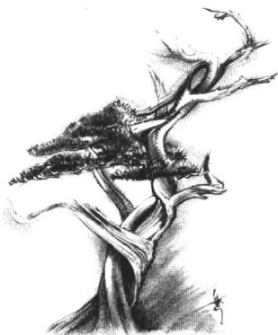
The Dancing Crane