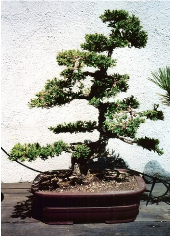
Filling in but still too tall

reasonable taper I couldn't just cut the top off and bring up another branch. This resulted in successive efforts to bend the top to the front to reduce the height.